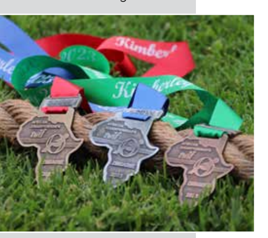
Gold, silver and bronze medals awarded at the 9th African Tug of War Championships.

shower. We had to hang onto gazebo's not to be blown away through lightning flashes. Recorders tried to save their paperwork. Laptops got shoved into jackets to protect them from the rain, and for the next 30-40 minutes it was chaos.