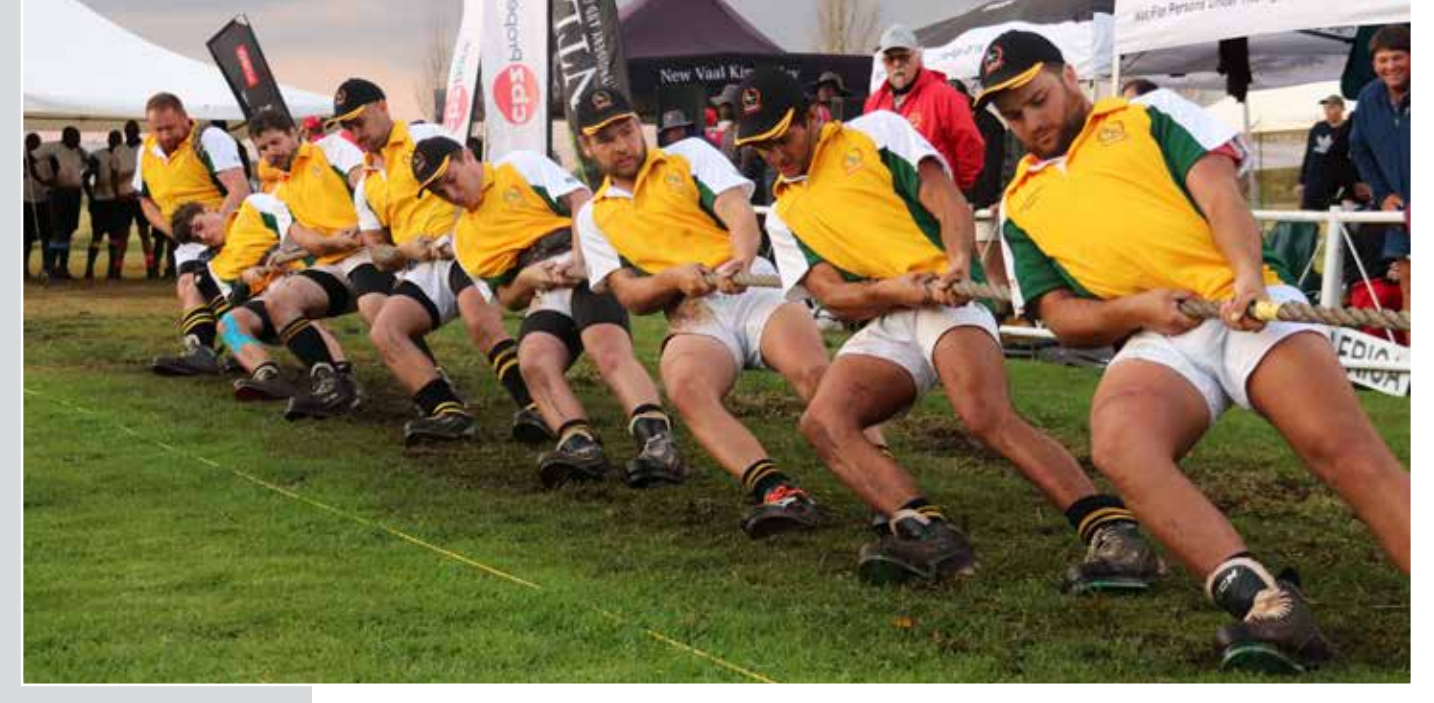
The SA 720 kg team in action.